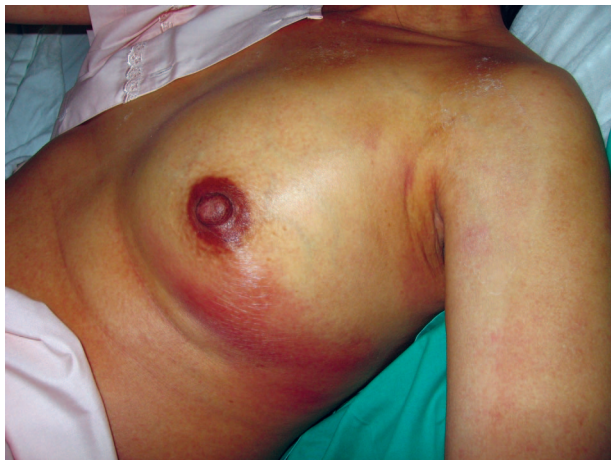
Fig. 1. Her left breast was swollen, warm, erythematous, and tender. Maximal tenderness and skin changes were noted over the lower outer quadrant of the breast.

Necrotizing fasciitis of the breast usually necessitates mastectomy because of delayed diagnosis. 1-3 This condition has variously been misdiagnosed as cellulitis, abscess, and even inflammatory breast cancer. The cutaneous features of necrotizing fasciitis as the disease evolves from early to intermediate to late stages have previously been described. 4 In the breast, however, because of the thicker tissue between the deep fascia and