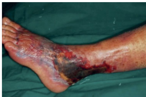
a Necrotizing fasciitis of left foot

Patients with NF usually present with the triad of pain, swelling and erythema 5,7,9,11–13 . It is often misdiagnosed as cellulitis or abscess. The most consistent feature of early NF is that the pain is out of proportion to the swelling or erythema 7,9–11 . Four other features are diagnostic clues to differentiate NF from simple soft tissue infection: the tenderness extends beyond the apparent involved area owing to enzymes and toxins spreading along the fascia below the skin; margins of involvement are indistinct; lymphangitis is rarely seen in NF because the infection is in the deep fascia and not in the skin 19 ; and NF is rapidly progressive despite the use of antibiotics 19 . Regular review of the patient's condition with a visual pain score and marking of the extent of infection on the skin can be helpful in equivocal cases.