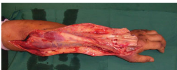
b After debridement

Fig. 2 a Necrotizing fasciitis of the left arm demonstrating ruptured bullae with clear fluid, fixed discoloration and skin gangrene. b Thorough debridement of the involved fascia showing underlying tendons and muscle bellies; note the extent of the debridement