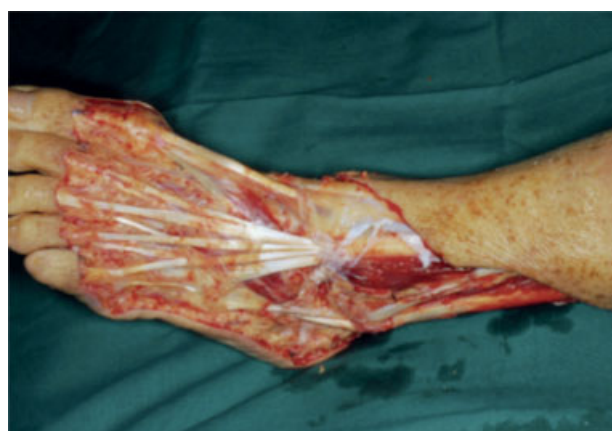
b After debridement