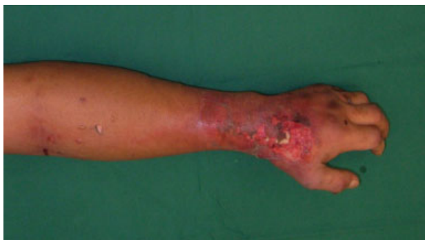
a Necrotizing fasciitis of left arm

*Value reflects combined wound and blood cultures.